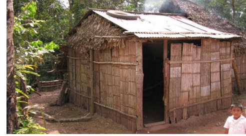
Rural bamboo house