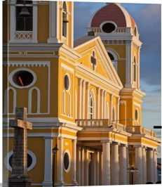
Cathedral de Granada, Art Gallery

An ocelot ( Leopardus pardalis ) at the animal rescue centre in the Nicaraguan national zoo